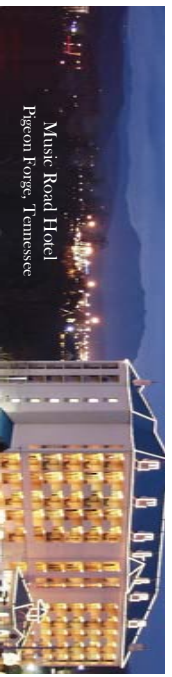
Music Road Hotel Pigeon Forge, Tennessee

Healthy Visions Wellness Center 800 Oak Ridge Turnpike, A-208 Oak Ridge, TN 37830